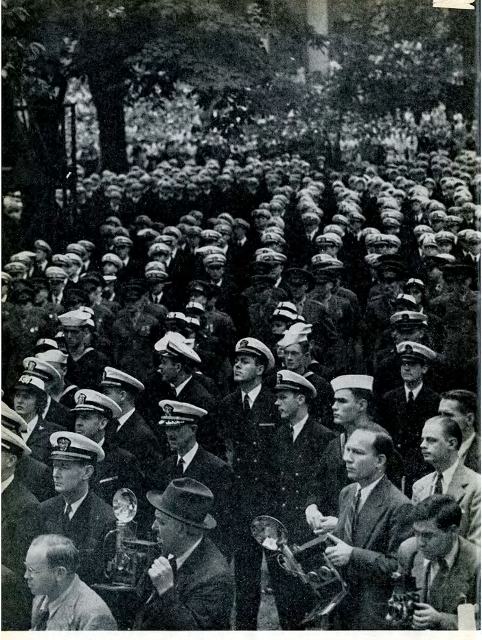
"If We are Together, Nothing is Impossible"