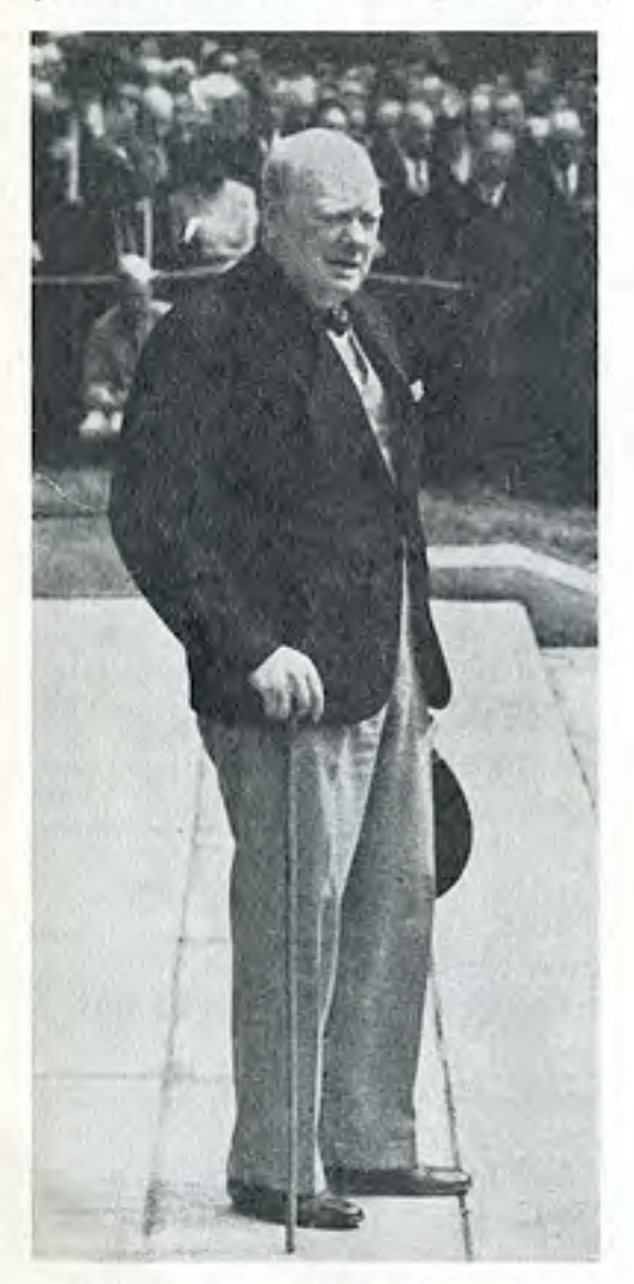
THE MAN, THE HAT, THE CANE

A BUGLE SOUNDED. Three minutes later, to the Second Connecticut March, the academic procession entered the Theatre—the Faculty by the south entry, the Overseers and dignitaries by