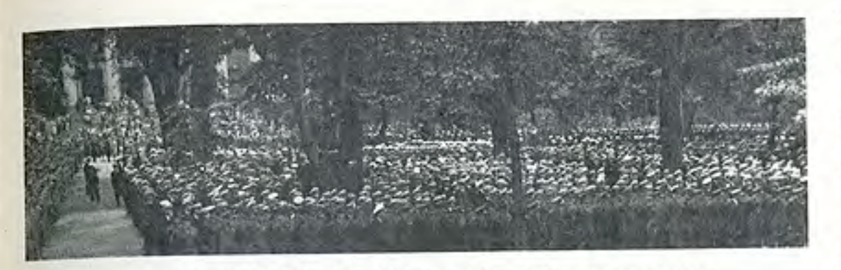
THE YARD IS FILLED WITH THE ARMY AND NAVY

could see his lips move. "Very good," he said. The Governor had concluded: