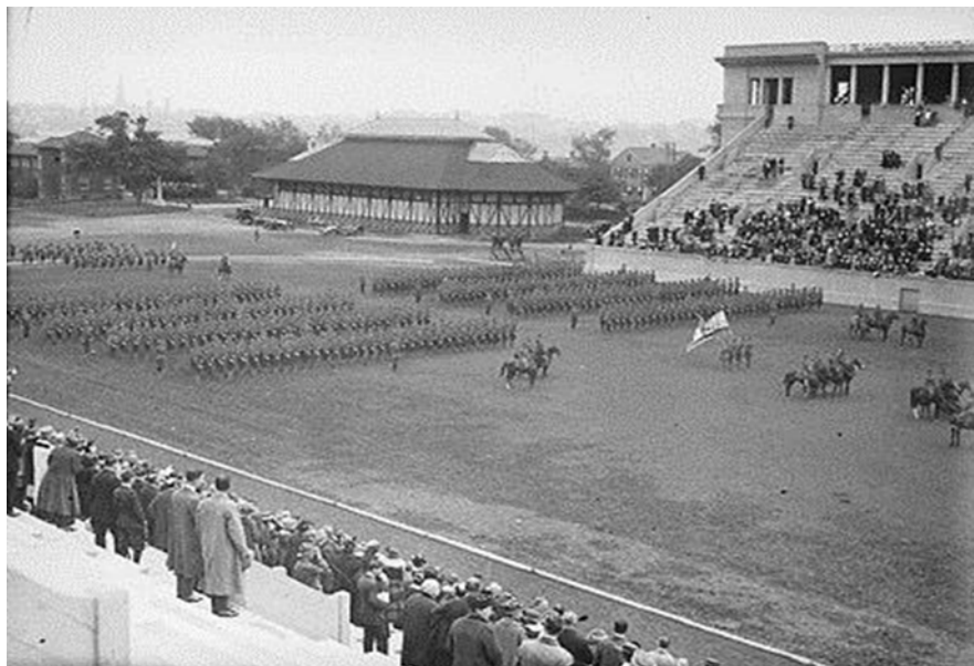
Army's Harvard Regimental Review at Harvard Stadium 1916