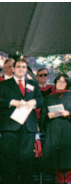
ROSE LINCOLN/HARVARD NEWS OFFICE