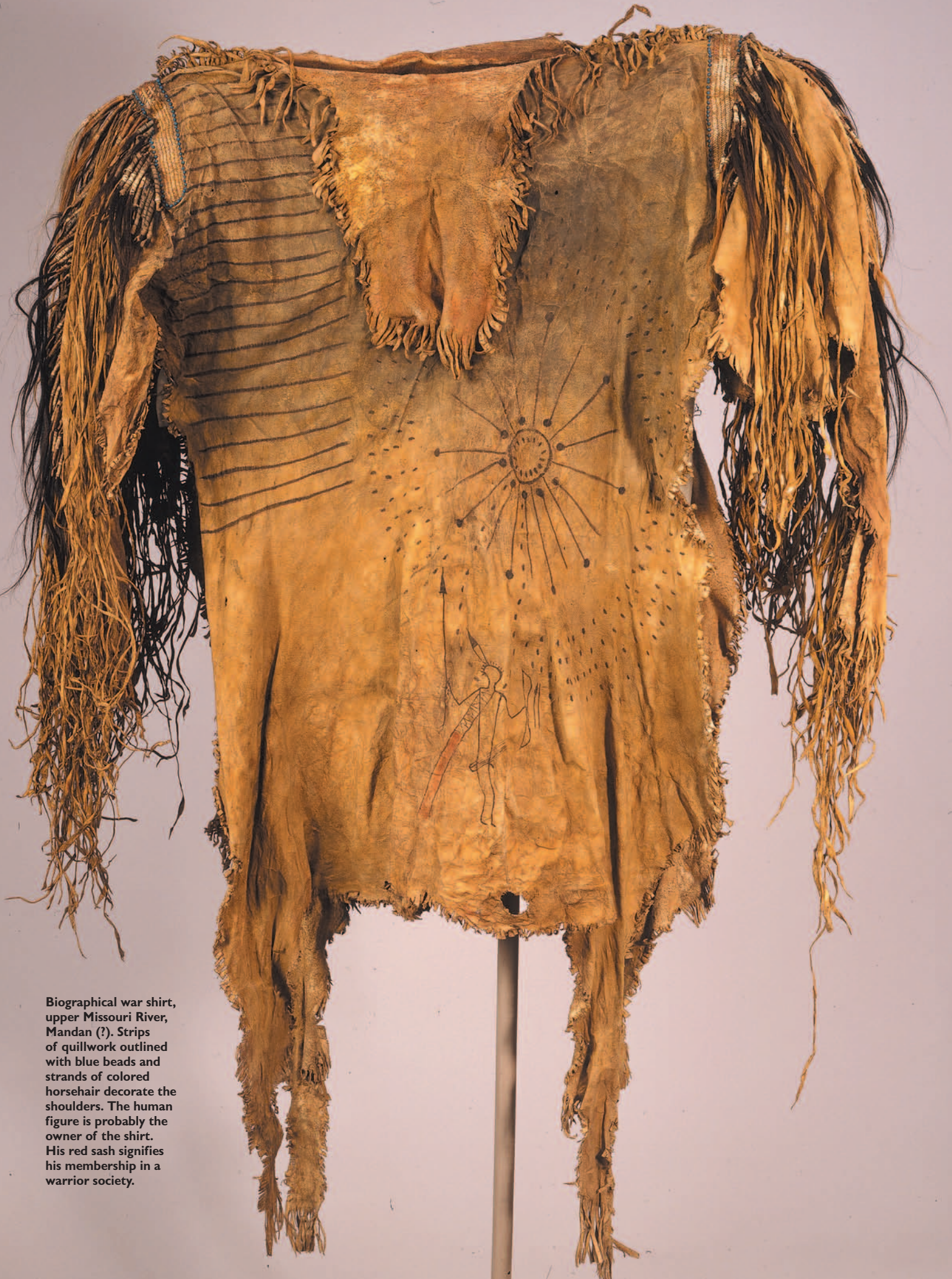
Biographical war shirt, upper Missouri River, Mandan (?). Strips of quillwork outlined with blue beads and strands of colored horsehair decorate the shoulders. The human figure is probably the owner of the shirt. His red sash signifies his membership in a warrior society.