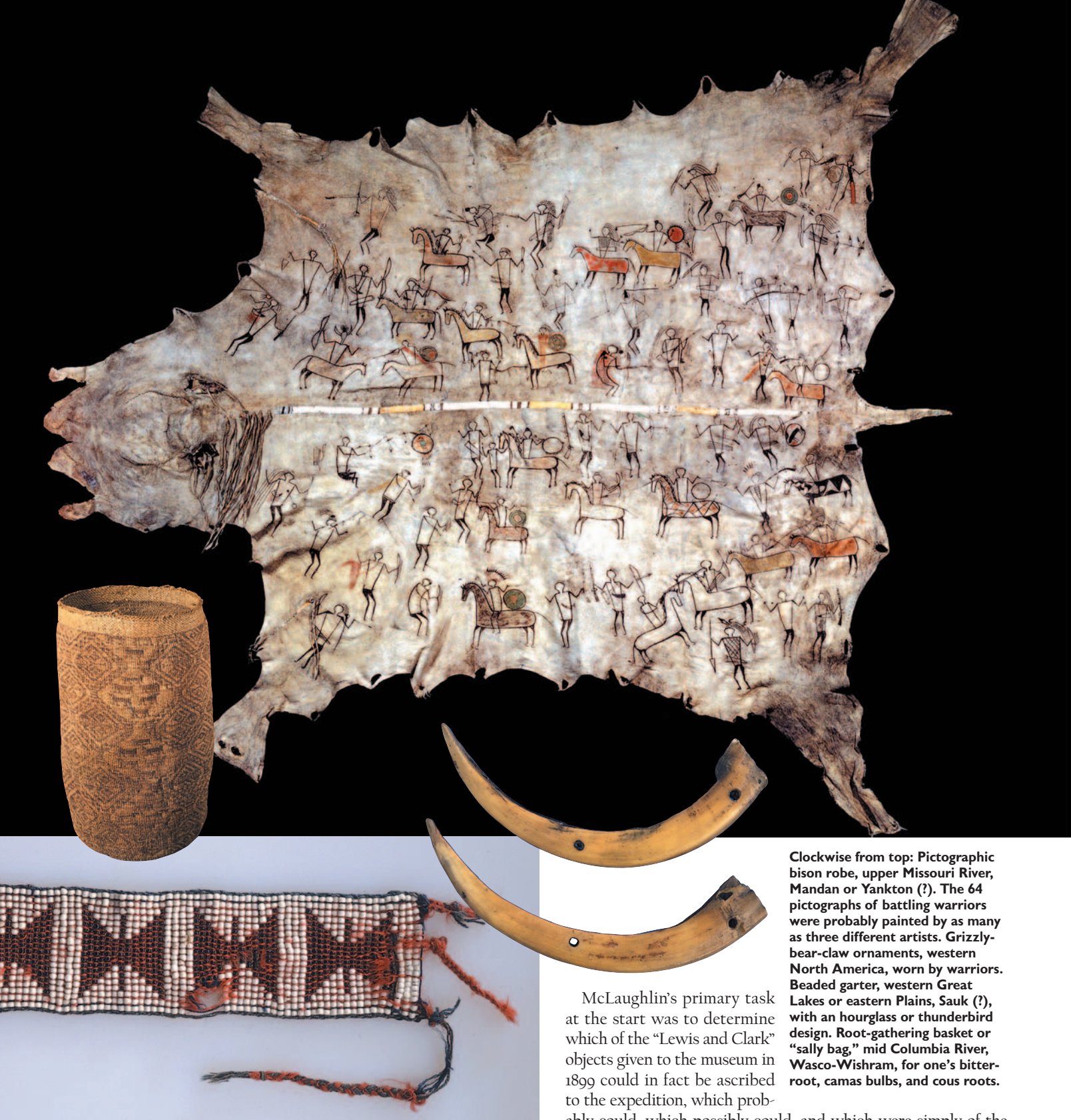
Clockwise from top: Pictographic bison robe, upper Missouri River, Mandan or Yankton (?). The 64 pictographs of battling warriors were probably painted by as many as three different artists. Grizzly-bear-claw ornaments, western North America, worn by warriors. Beaded garter, western Great Lakes or eastern Plains, Sauk (?), with an hourglass or thunderbird design. Root-gathering basket or "sally bag," mid Columbia River, Wasco-Wishram, for one's bitter-root, camas bulbs, and cous roots.