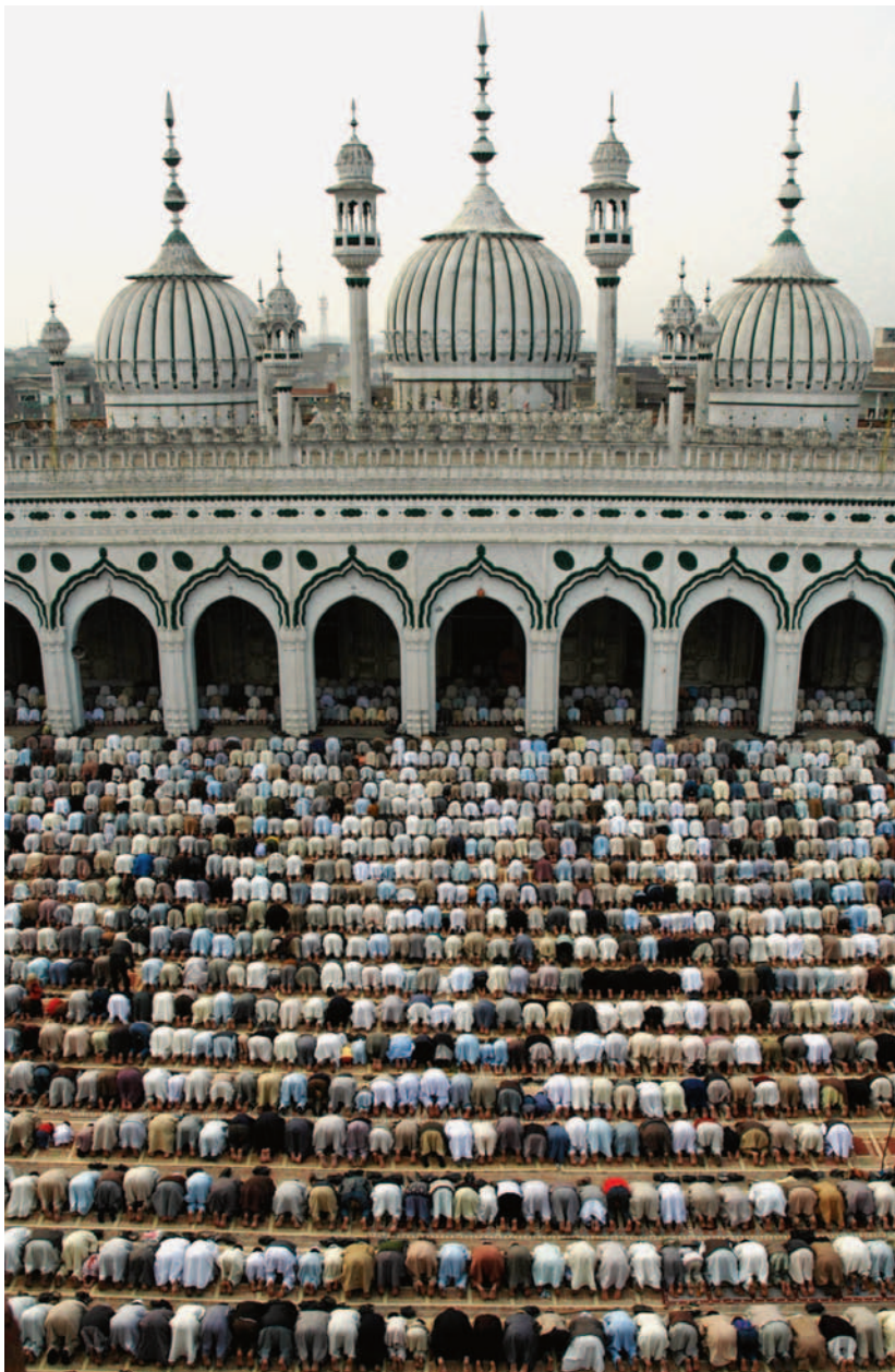
The final Friday prayers of Ramadan in Rawalpindi, Pakistan—one of the world's principal Muslim nations—this past November