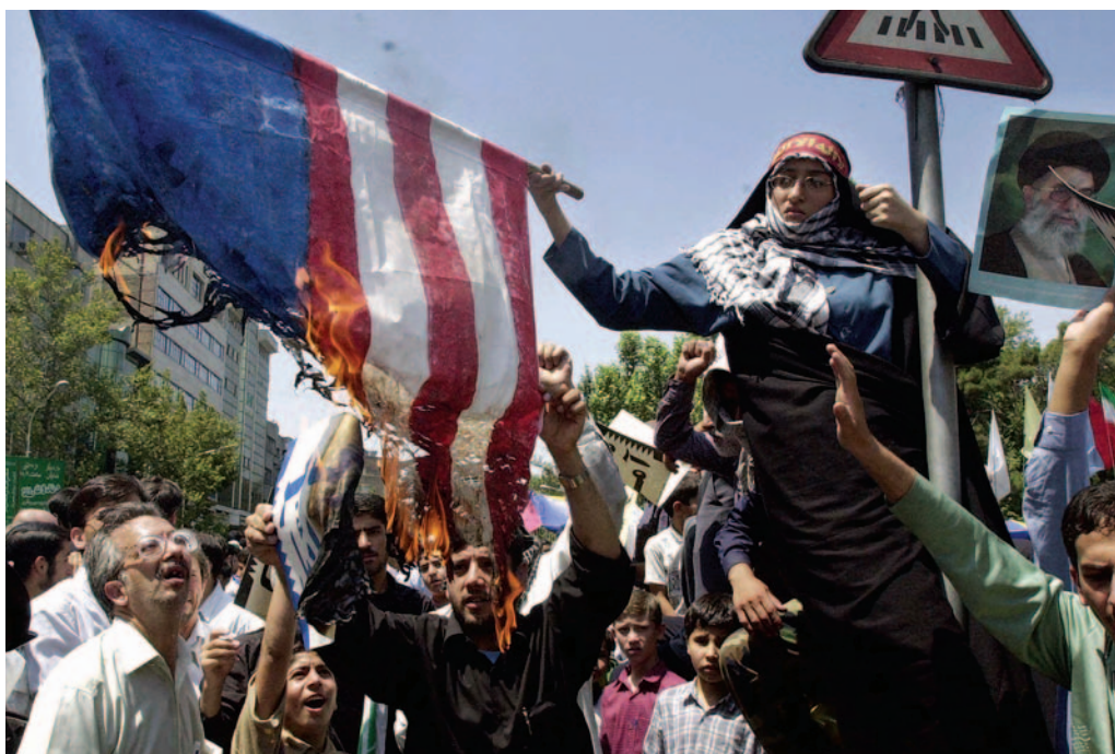
An anti-America, anti-Israel rally in Tehran, August 2001

eral remains a bastion of anti-Israeli and anti-American hostility and left-leaning multiculturalism.