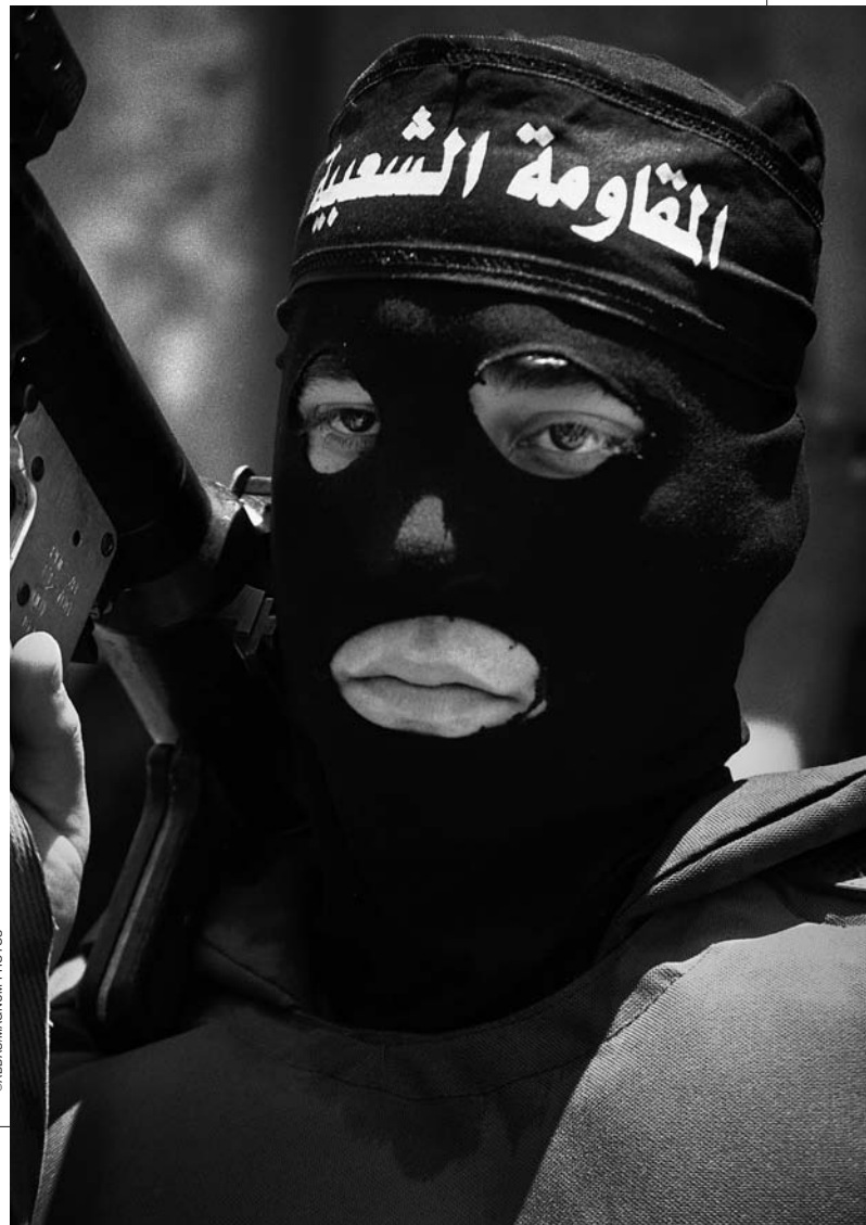
In Gaza City, a Hamas militant brandishes a rocket-propelled grenade.