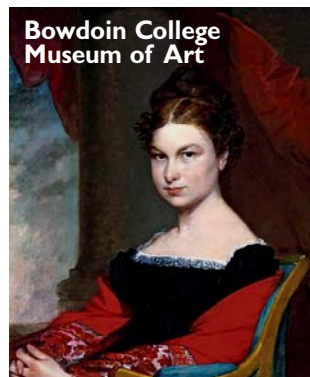
BOWDOIN COLLEGE MUSEUM OF ART

THE MUSEUM, reopened following a $20.8 million renovation, affords an intimate look at a range of works by such artists as Winslow Homer, Mary Cassatt, and landscapist John Appleton Brown, along with decorative arts, European paintings, some sculpture, ancient artifacts, and an interesting selection of African-American works.