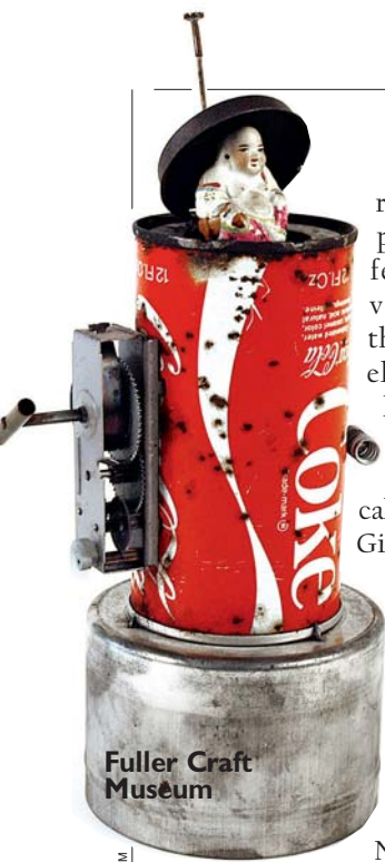
FULLER CRAFT MUSEUM