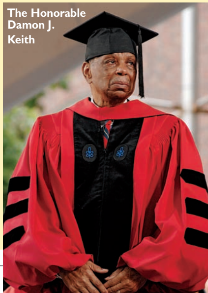
The Honorable Damon J. Keith