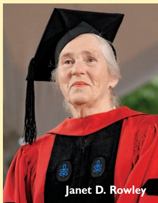
Janet D. Rowley