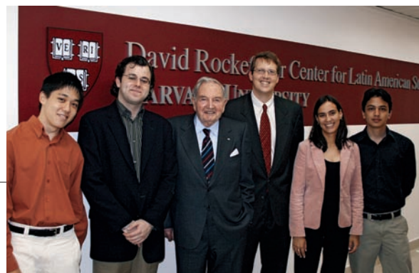
DRCLAS BRAZIL OFFICE STAFF

ing institutions as well. The new study centers and seminar rooms will be the centerpiece of the museums’ efforts to bring students and their teachers into direct contact with important works of art. Rockefeller’s support is the first announced for what promises to be an expensive, intricate effort expected to take as long as five years.