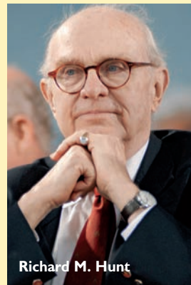
Richard M. Hunt