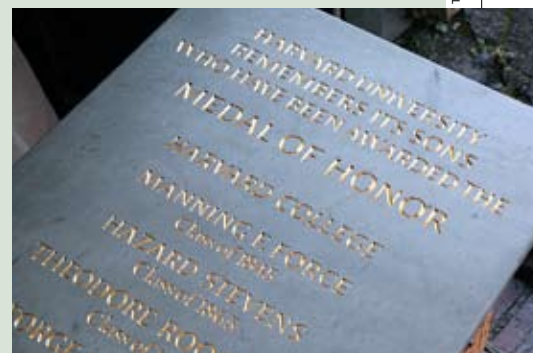
THE JOHN STEVENS SHOP