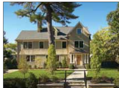
Cambridge... A private estate on Professor's Row near Harvard. Newly renovated by Copley Design & Development. Visit www.63FrancisAvenue.com . $4,250,000