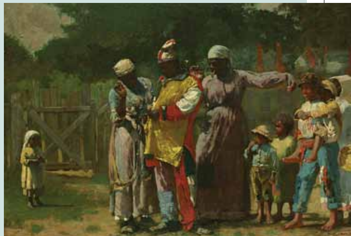
Winslow Homer, Dressing for the Carnival, 1877 , one of the paintings examined in Near Andersonville