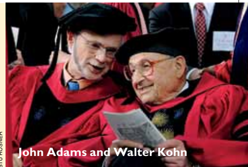
John Adams and Walter Kohn