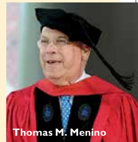
Thomas M. Menino