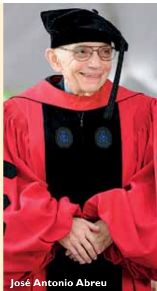
José Antonio Abreu