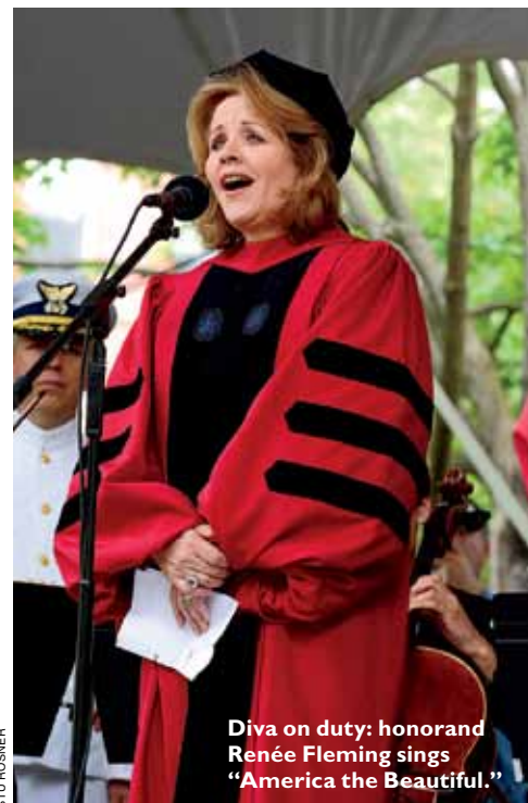
Diva on duty: honorand Renée Fleming sings "America the Beautiful."

And room for beauty, too. Amid the morning-after detritus, when discarded Crimsons and spent iced-coffee cups littered Harvard Yard, the campus rose above