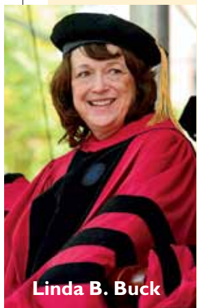
Linda B. Buck