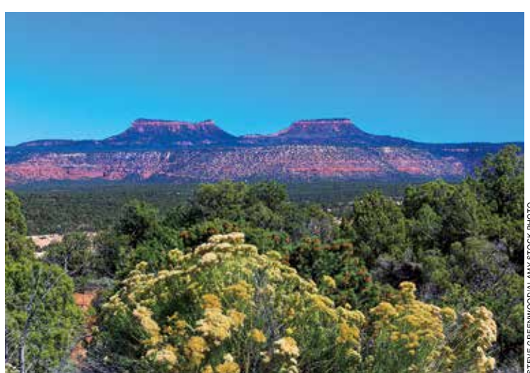
A glimpse of the Bears Ears National Monument, which is under threat of shrinkage by the Trump administration

leaked copy of Zinke's memo showed radical shrinkage recommended for both those monuments, as well as others, along with changes to the land management plans in many places to allow, Hedden says, for "traditional uses. Meaning: oil and gas and mining. In essence, it's an attempt admininstratively to make the American Antiquities Act of 1906 meaningless." GCT and many other groups, including the tribes who worked