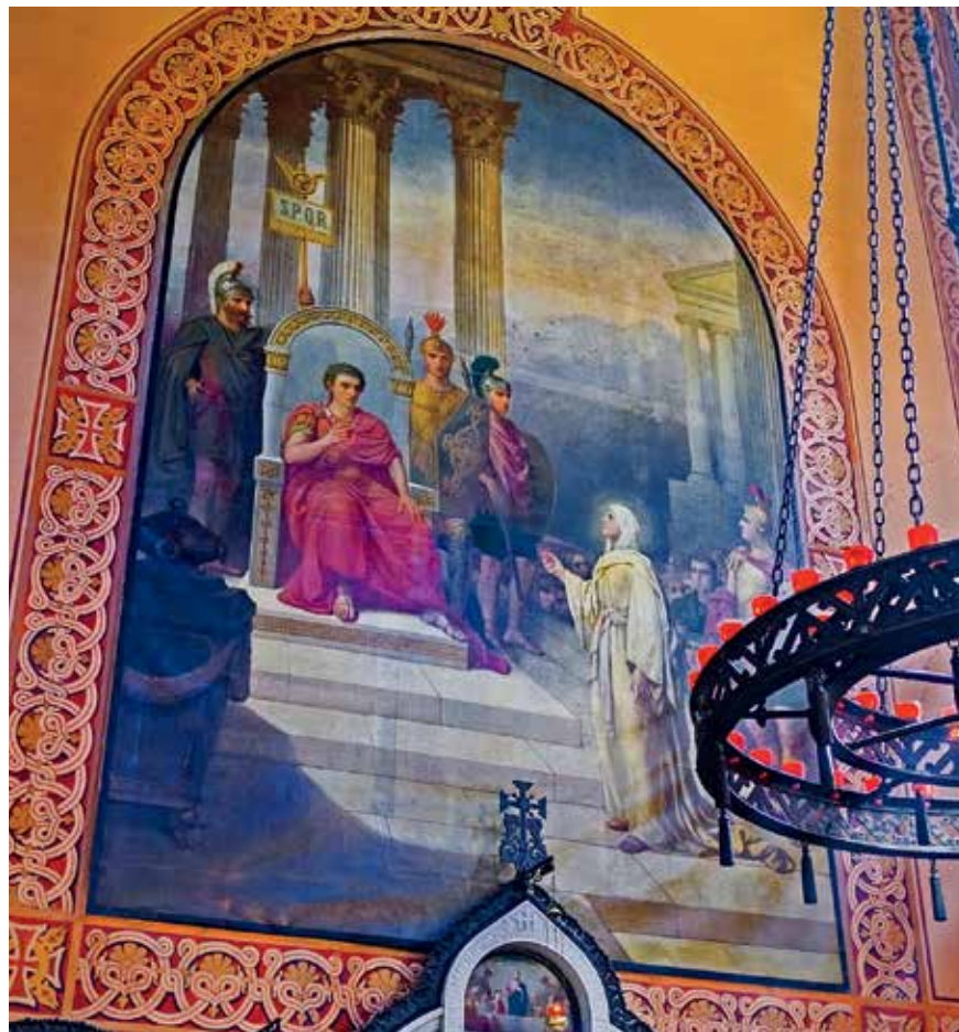
The Russian Orthodox Church of Mary Magdalene in Jerusalem shows her before Pontius Pilate with a red egg, a symbol of Jesus’s resurrection.

This time, she decided to look at suffering and illness and what Christian texts from the first three centuries might have to say about them. She didn’t find much. “There’s a lot about healing and faith. But basically it’s, if you pray and you’re healed, God has healed you. If you pray and you’re not healed, then God doesn’t want you to be healed for some reason.”