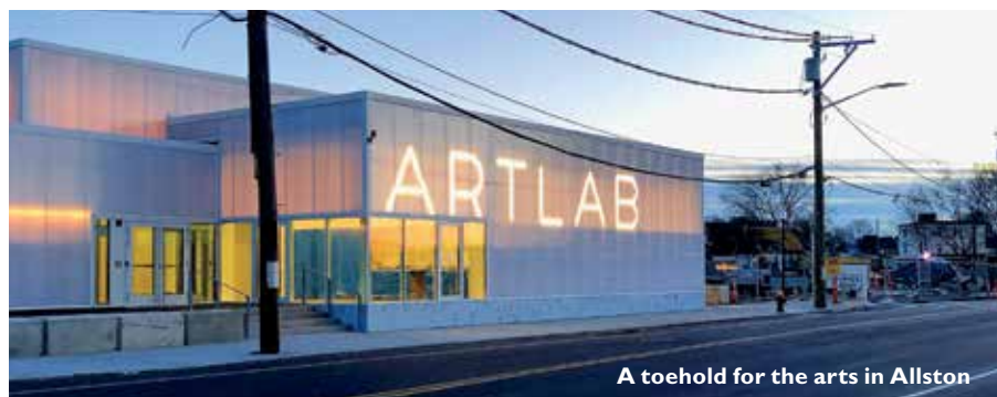
A toehold for the arts in Allston