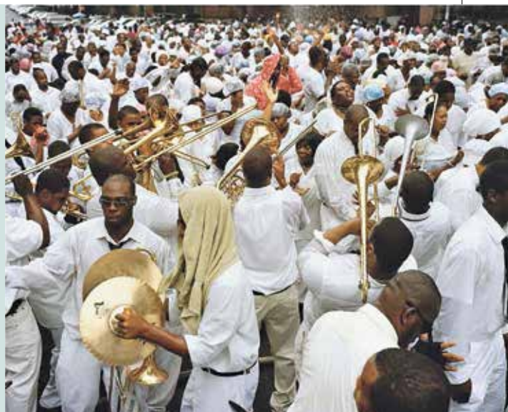
"God's Trombones, Harlem," 2009