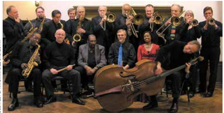
Members of Aardvark Jazz Orchestra