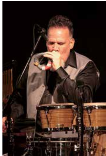
Drummer Lenny White leads his band at the intimate Regattabar; percussionist Manolo Badrena performs at the same venue.

ies made contributions as well, but Boston was unique in that it made major contributions to all of them."