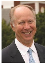
Dr. David Gergen

David is a Professor of public service and co-director of the Center for Public Leadership at the Harvard Kennedy School, positions he has held for over a decade. In addition, he serves as a senior political analyst for CNN and works actively with a rising generation of new leaders. In the past, he has served as a White House adviser to four U.S. presidents of both parties: Nixon, Ford, Reagan and Clinton. He wrote about those experiences in his New York Times best-seller, Eyewitness to Power: The Essence of Leadership, Nixon to Clinton (Simon & Schuster, 2001).