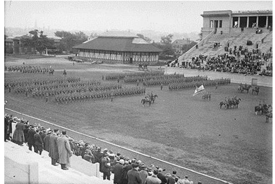
Army's Harvard Regimental Review at Harvard Stadium 1916