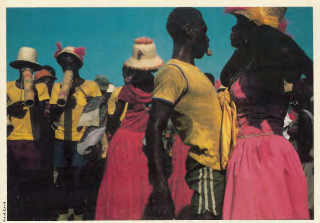
During a spring festival around Eastertime, the Haitian countryside explodes with Rara bands of vodoun aco-