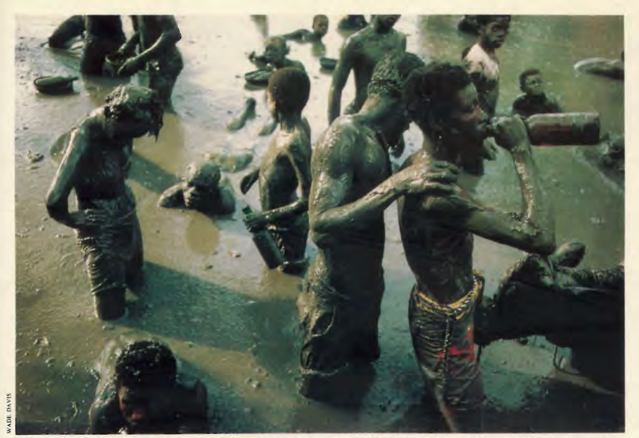
A festival at Plaine du Nord, where vodounists pay homage to Ogoun, god of fire and war. The pilgrims light candles for the god and offer rum and meat; a bull